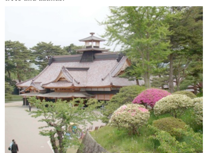
The Magistrate's house inside Fort Goryokaku is the equivalent of Government House in Sydney except that battles have been fort for the right to occupy this position

We were unsure about how to fit all this in but started at the nearby bus station thinking to go to Mt Hakodate before the weather changed but the first bus didn't leave until 9.40 so we headed to Fort Goryokaku instead. This was an old fort to protect the Shogun appointed Magistrate, the equivalent of an Australian colonial governor in powers. It was surrounded by a star shaped wall and moat that are now adorned ornamental cherry trees and azalias.