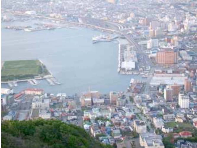
With a population of 280,000, historic Hakodate is the third largest city in Hokkaido and probably its most attractive. The night view if the city below is claimed as one of the top three-night city scenes in the world with Naples and Hong Kong. Below Motomachi churches.

We had a wonderful seafood dinner, more upmarket than any others and made our way back to our hotel.