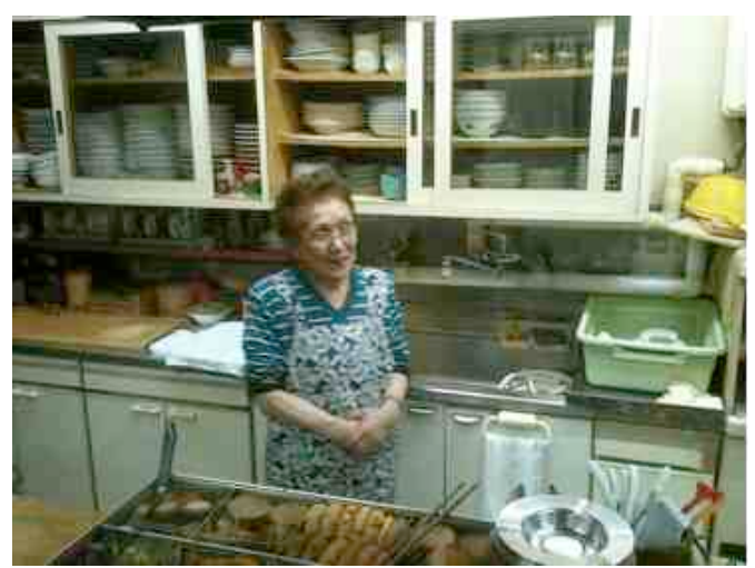
Octagenarian Wakknai Restauranter served us an amazing noodle dinner.

probably near 90. One man, possibly a grandson, came in, had a beer, looked around and spoke briefly and kindly to the old lady to say he was just checking on her welfare.