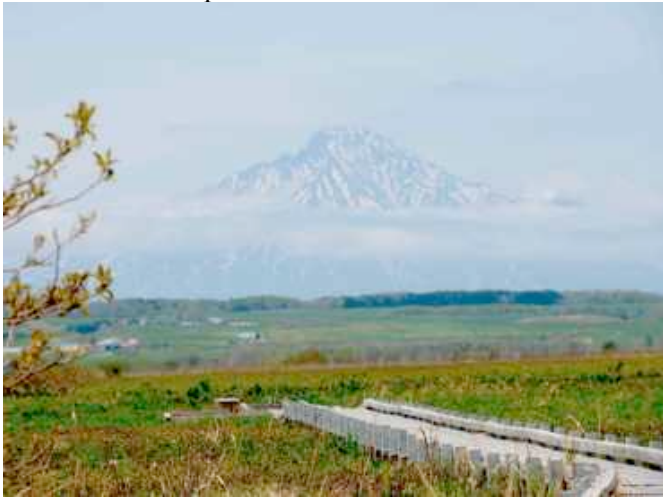
The mile high (!721 metre) Mt Rishiri is visible from almost everywhere in the Sarobetsu Wetlands

The wetlands are slowly being invaded by Bamboo Grass. That seems to indicate that the wetlands are drying out. Our taxi driver described the transformation as being relatively swift as he remembered it as all open wetlands not so long ago and now blanketed with Bamboo grass. This is hardly surprising considering the huge drainage ditches beside the roads running through the wetlands and the industrialization (quarrying) occurring of peat for the horticultural industries. At the visitor Centre is an exhibit of a large dredge used right through the 1970s to extract the peat. The peat is from 3 to 7 metres deep.