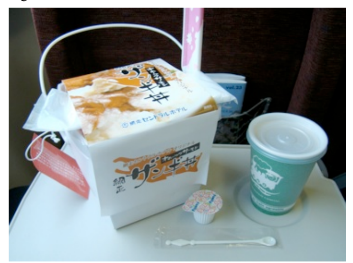
One of the many meticulously prepacked meals on the sold on the Sapporo Express. No food was sold on the second leg to Wakknai

The day began with grey skies as we breakfasted at the very comfortable Toyoko Hotel near the Abashiri Railway Station where we were to catch the train 9.50 am. The train was a fast express heading to Sapporo but we changed trains at Asashikawa before Sapporo to head north to the most northern city of Japan, Wakknai. It was drizzling rain which got heavier at times during the day as we sped through the verdant green countryside. The first part of the journey covered some mountainous areas with deep valleys and mountains high.