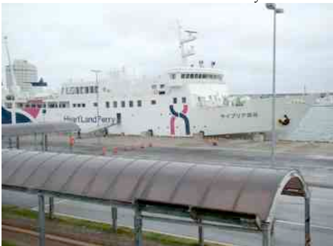
One of the ferries servicing Rishiri and Rebun, Japans most northerly islands. This was our third boat trip in seven days (including Akan Lake and Shiretoko

We went down to find our boots carefully laid out ready and waiting for us to step into to board the owners's vehicle so that he could drive us to the ferry terminal.