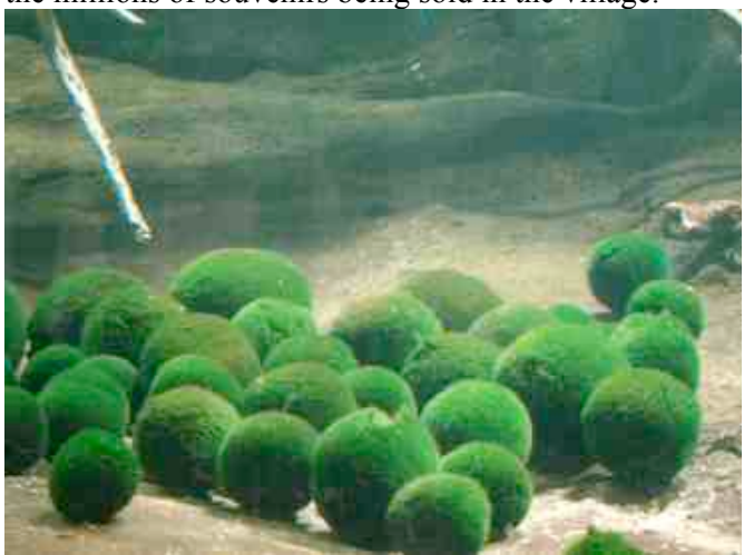
Marimo in Lake Akan's Churui Island Display Centre

After a curry buffet we boarded Marimo Maru , one of the huge ferries to take a tour of the lake. The tour takes about an hour and a half but it was great vale. We landed Churui Island, the smallest of the lakes' four islands to visit the Marimo Display Centre. Here we could see first hand these amazing emerald green balls of algae in various sizes in aquariums. They are the main tourist attraction of Akan and the basis for most of the millions of souvenirs being sold in the village.