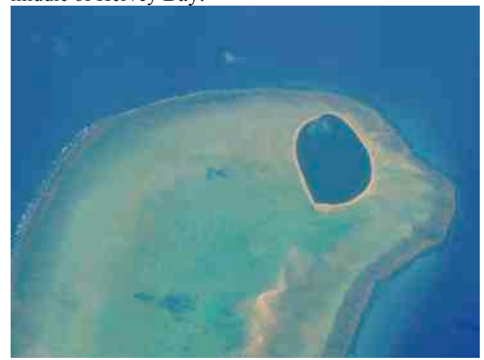
Lady Musgrave Island last visited in December 2011 as seen from above 21 May 2012

The flight north took us over Stradbroke, Moreton and Bribie Islands and Noosa although there were only glimpses between the many small clouds. Rushing to the Starboard side as we approached Fraser Island it was amazing to note that we passed over Eurong where we had just been weeding the previous week. The clotted clouds started to break open towards the western side of the island providing great views of Moon Point and Rooney's Point as we made our way north up the middle of Hervey Bay.