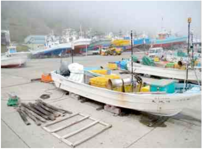
Fishing in Rausu, a city strung out for kilometres along the coast isn't just an amateur obsession. It is serious business in some of the most productive waters of the globe

The road Route 344 through the Shiretoko Pass was really quite stunning as it ascended towards the side of Mt Rausu. The air was crisp, sky was clear and sunny and we felt quite exhilarated by our surrounds on this very scenic drive. We stopped in the Rausu Visitor Centre, the third visitor Centre for this World Heritage site. It manages and serves the other side of the peninsula that has a larger local population, most of whom are focussed on harvesting the very productive sea.