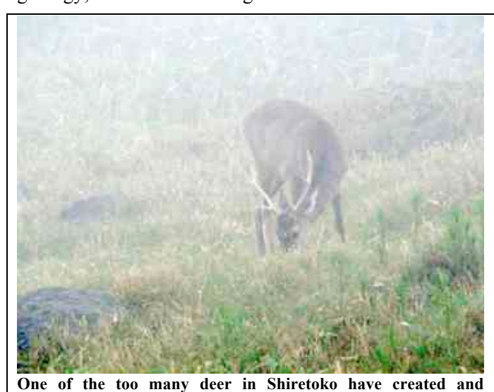
environmental dilemma. With the absence of traditional Ainu culling the area is so over-populated that they are damaging the forest by stripping the trees of bark during winter. The Shiretoko Nature Foundation has now implemented a culling program to reduce deer population to a sustainable number. Much of the area near the Shiretoko Goko lakes had been

It was a very full and exhausting day and we fitted so much into it we felt as if we had some real understanding of this great World Heritage site which has many problems in common with Fraser Island as well as many similarities despite some most obvious contrasts between the two, especially in geography, geology, and cultural settings.