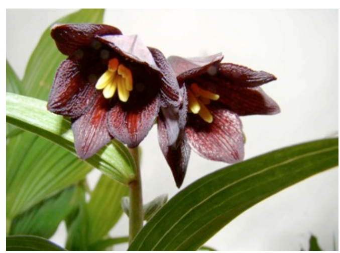
Rebun Island Black lilies found near Lake Kushu

Our first stop was at Lake Kushu where we went for a walk and were thrilled to discover among the wildflowers a lot of "Black Lilies" that are really orchids.