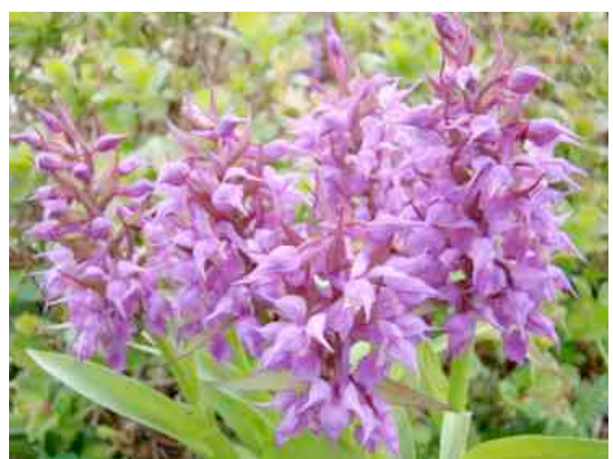
These Rebun Island endemic ground orchids were among about 50 primeval flower species we photographed during a thrilling four-hour exploration of this island.

We ended the day trying to find the old lady's restaurant again but when we did it was closed. We settled for a nearby alternative run by a very efficient and pleasant man and it turned out to be at least as interesting and pleasant meal as we had last night. From a day that started with no great expectations it was a very full and satisfying day.