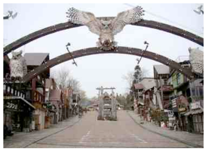
The small Ainu population in Hokkaido exerts a powerful cultural influence as epitomised in this Akan Ainu Kotan where the all seeing owl has all visitors in its sights at all times. It is a powerful symbol for tourist souvenirs

It was a bit brisker and fine when we woke and after catching up with this diary we enjoyed a typical minshuku breakfast before walking over to the Ainu Kotan to capture some images we hadn't seen last night and to succumb to acquiring a few more small We also acquired some good local knowledge from an Ainu shop-keeper and headed out of tow without much delay to enjoy the beautiful weather of the day to see Mashu Ko. (Ko = Lake). It was a longish drive up a couple of mountain sections that had our motor mower sized engine working hard. There were a couple of stops but at one lookout over some small lakes where many birds were singing loudly we resolved a riddle we had posed as to the high and elaborate fencing lining some odd sections of road. They apparently stop the snow sweeping across and piling up on these vulnerable sections of road.