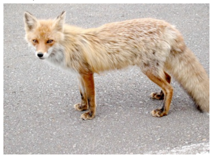
A red fox crossed our path as we drove by

After a close encounter with a fox on the way we descended to confront another not yet quite extinct volcano, Mt Iwo.