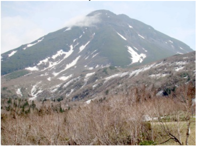
Mt Rausu, the highest Mountain in a chain all above 1500 metres within the National Park sits beside the Shiretoko Pass. While it was bathed in sunshine the low, thick fog obscured all views along the coast as we drove on to the Notsuke Ramsar site.

The Foundation is a locally based non-profit organization and has been dedicated to conserve wild flora and fauna and to promote adequate utilization of the Shiretoko National Park since 1988. It organizes volunteer programs, community engagement and enforcement. It is like an overgrown FIDO. Foundation is both an advocate and the practitioner but answerable to the Ministry of Environment.