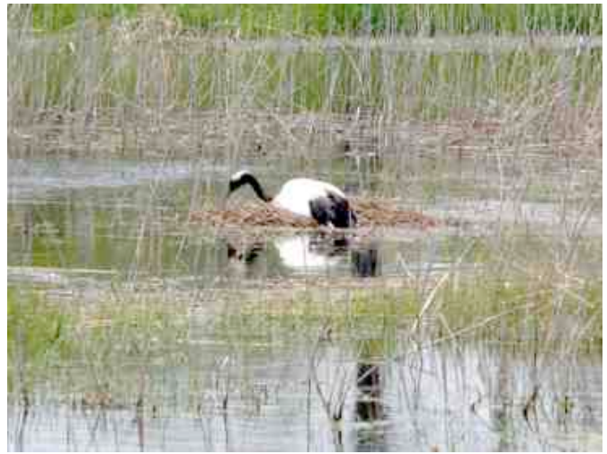
Red Crowned Crane on her nest near Kuchiro

Red Crowned Crane (Grus Japonensis) with a wingspan of 2.4 m. Although they were nearly extinct in the 1920s the population has increased owing to the local people's conservation effort. The population is about 1,000 now and most of them live in the Kuchiro and Nemuro region.