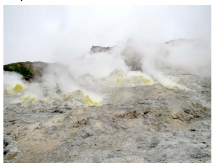
Mt Iwo vents its sulphurous steam as a symbol of the powerful volcanic influences in the region

We stopped for lunch in Kawayu Onsen close to the Kawayu Eco Centre. Here we made our inquiries from a young interpretive officer who we discovered had spent five years in Australia studying ecotourism at Flinders University in Adelaide. The Centre is run by the Ministry of Environment and focussed on providing interpretation of the track from the Centre to Mt Iwo.