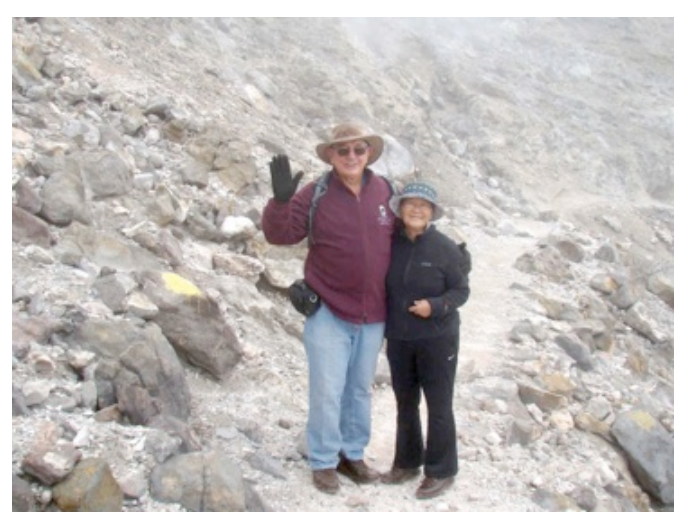
Among the sulphurous fumeroles on Mt Nasudake above 1,700 m (mile high) level