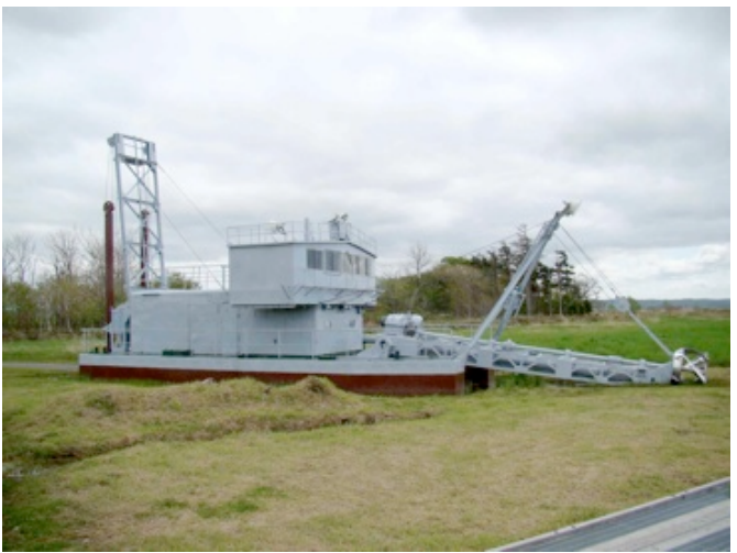
This dredge was once used to extract the peat from over 170 hectares of the Sarobetsu wetlands. Peat extraction and drainage continues and the wetlands are slowly drying out. This wildflowers here are complementary to the diversity seen on Rebun Island

With Kurishiro, Akan, and Shiretoko, this was the fourth of the six Japanese National Parks in Hokkaido we have visited in the last week. The concept of Japanese National Park's is quite interesting because this park includes 11.8% private land and 6.1% public land (presumably roads and utilities etc.) and 82.2% government land. Luckily for us it was a fine day and the temperature rose progressively through to the top teens.