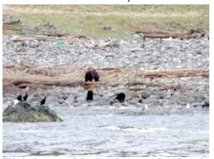
This is the story of the three bears prowling along the shores of Shiretoko World Heritage area as seen from the "Brown Bear". They were among many we saw that day.

Although the tour had trivialized some of the coastal features by focussing on the oddities in an anthropocentric way, as the tour progressed it provided more focus on the environment. There were vast populations of Slaty Grey Gulls (that seemed almost identical to the Pacific Gull of southern Australia except for a colour shade. Cormorants, kittywakes and lots more sea birds and a few raptors with one sighting of a rare white tailed eagle. The highlight though was to see so many Hokkaido bears in the wild. There were at least nine going about their business along the shore, fishing and gathering fruit. Fortunately it wasn't raining for our al fresco tour but unfortunately the low cloud fogged out a view of the magnificent mountains towering above. The boat trip we reminiscent of the Lord Howe Island round island trip.