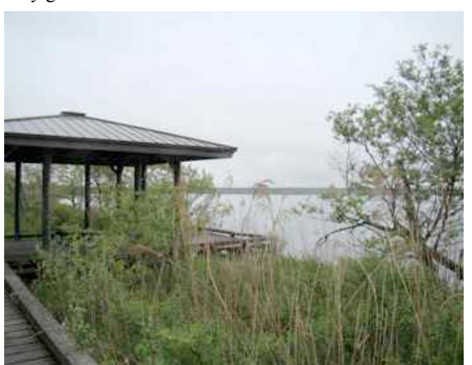
Utonai-ko was one of six Ramsar wetlands we visited in Hokkaido. Each has its own Visitor Centre. Some such as Sarobetsu have more than one. It would be great to see a Ramsar Visitor Centre on Great Sandy Strait at Maaroom or Mary River Heads

We surmised how these people living so close to the low seashore might fare in a tsunami and when we were in Hakodate we learnt first hand by the 1.5 metre wall of water that surged through parts of the city and the havoc it wrought. We arrived at the station at 4.30 pm and settled in a very comfortable nearly hotel with a slightly larger room. We wandered the waterfront and were found by an enterprising restuaranter World Heritage led us into his very standard restaurant for a very good meal.